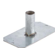
1-Gang Center Bottom Feed Plate