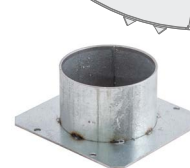
2-Gang Center Bottom Feed Plate*