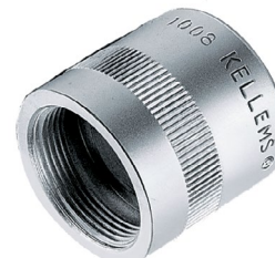
091041006 Thread Adapter