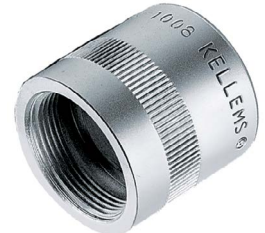
091041006 Thread Adapter