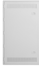
Hinged Vented Door