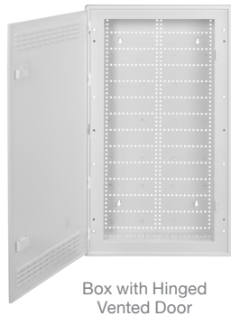
Box with Hinged Vented Door