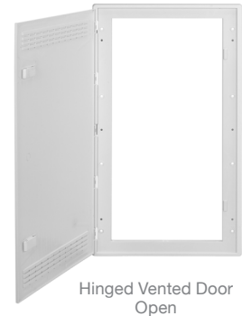
Hinged Vented Door Open