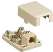
Telephone Surface Mount Jack, 6-Position, 4-Conductor, Screw Terminations