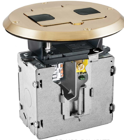
RF509BR, RJ650BKTR, RF500 with Divider

Note: Template cutout provided with instructions for proper installation.