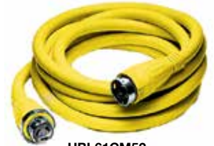
HBL61CM52 HBL61CM52W HBL61CM42 HBL61CM42W