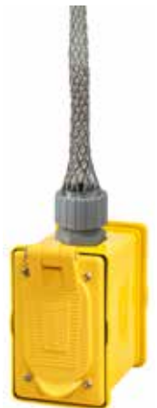
Deluxe Cord Grips (purchased separately)