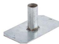
1-Gang Center Bottom Feed Plate