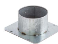
2-Gang Center Bottom Feed Plate*