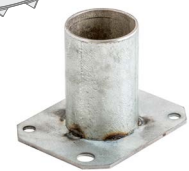
Perimeter Bottom Feed Plate