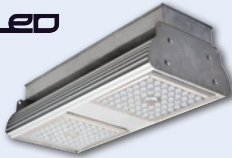
(2' High Lumen Shown)