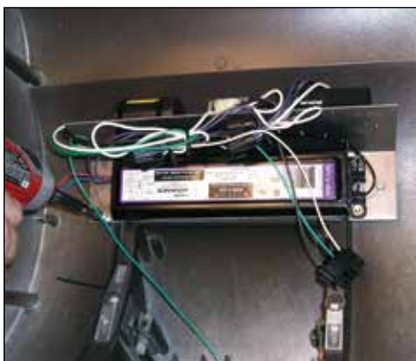
14. Slide Driver Assy under screws and lock in place then tighten (3) screws for WD14. For WD18, tighten (2) screws