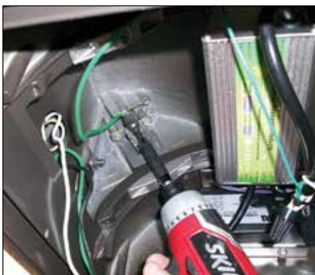
15. Attach ground lead to boss in rear housing with screw and lockwasher provided.