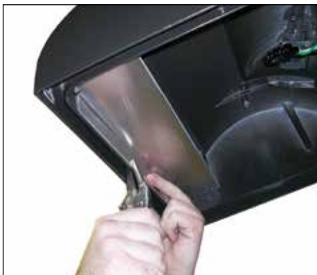
11. Secure front drilling template to inside of housing with locking pliers.