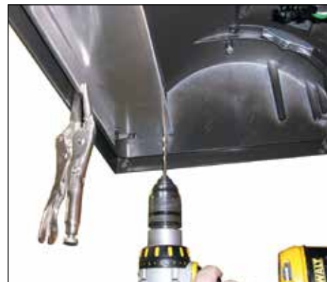
13. With a .166" (#19) drill bit, drill holes 3/8" deep in bosses required. Keep template in place to stop drill from wandering off center.