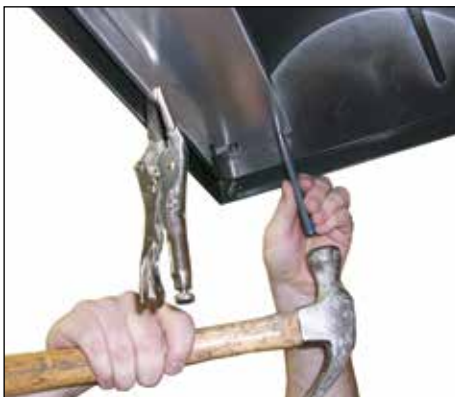
12. Center punch bosses inside fixture housing using template hole locations.