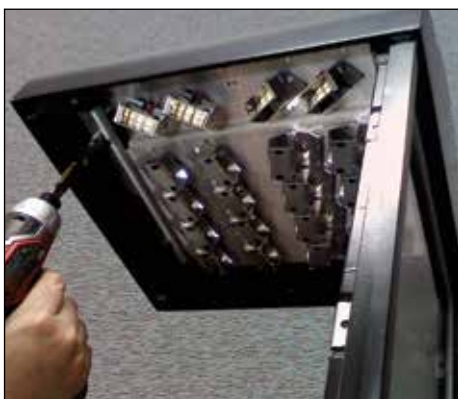
17. Thread screws into drilled holes half depth and lock emitter deck into place and tighten screws.