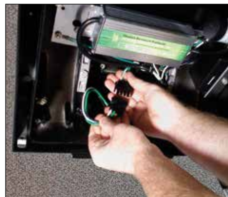
16. Connect disconnect plugs between field wires and driver assembly. Connect disconnect plug between Emitter Deck and driver assembly.