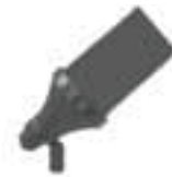
Full Glare Shield

P.O. Box 60080 • 16555 East Gale Ave. City of Industry, California 91716-0080 626/968-5666 • FAX 626/330-3861