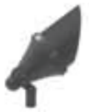
Adjustable Glare Shield