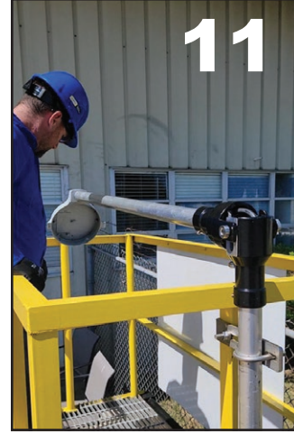
THREAD THE CABLE UP THE TOP POLE AND INSERT THE POLE INTO THE HINGE

P/N KIL00921301 FORM NO. K1301 04/21 ERO 8-018-21