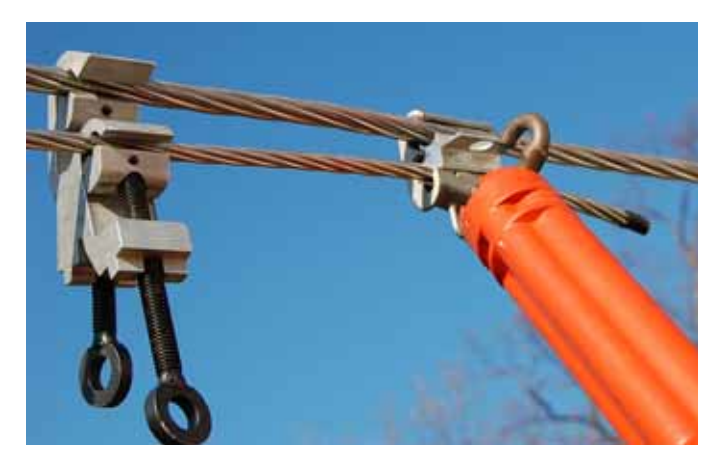
10) Release interface from hot-stick. Make sure it is fully inserted against the stop.