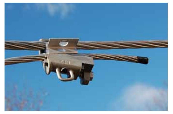
12) The bolt head should break off at 110- 130 IN LBS (12-14 NM)

13) IMPORTANT: REMOVE PIGGYBACK CLAMP WHEN FINISHED.