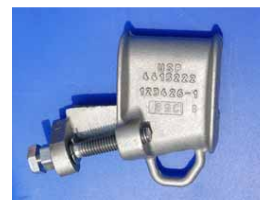
3) Unscrew drive bolt until connector is fully open.