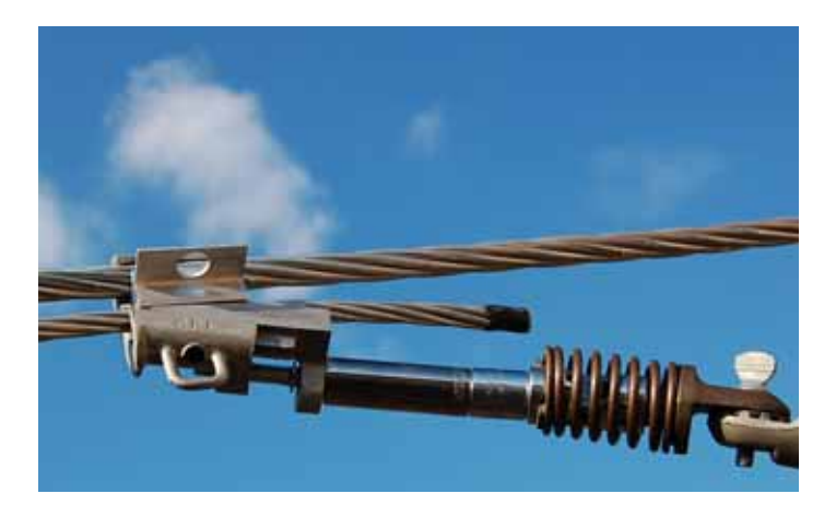
11) Use a deep socket and universal socket stick tighten drive bolt until Hex Head shears off.Make certain that socket is fully engaged.