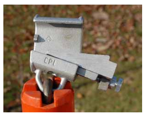
4) Hook C-BODY with hot-stick.

2) Attach piggyback clamp to MAIN CONDUCTOR.