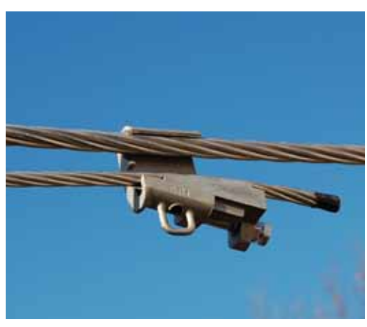
6) Capture MAIN conductor SECOND.