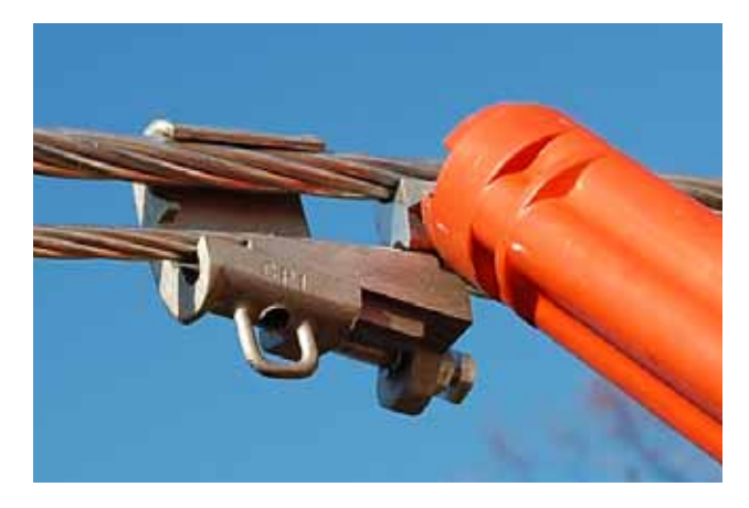
9) Slide INTERFACE along MAIN CONDUCTOR until it reaches the stop.

8) Orientate INTERFACE on the short stub of the hot-stick in the same direction that it will be inserted into the tap connector. This will allow easy removal of hot-stick.