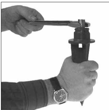
1. Tighten coupling onto mounting device*.

! Make certain the electrical supply is OFF before starting fixture installation.