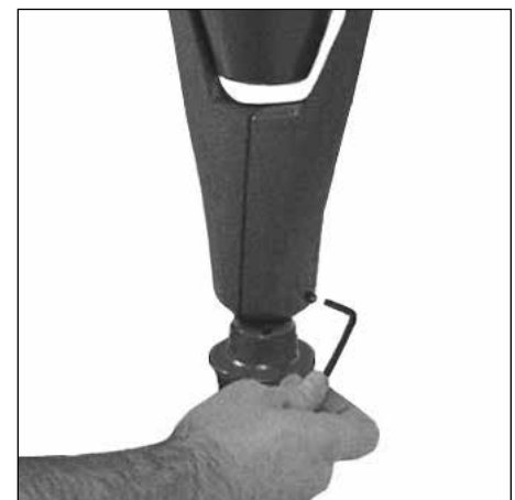
3. Loosen setscrew, adjust fixture rotation, and tighten setscrew.

IMPORTANT: Do not overload the transformer by installing higher wattage lamps than planned. Remember, the total wattage of all lamps connected to one transformer must not exceed the capacity of that transformer.