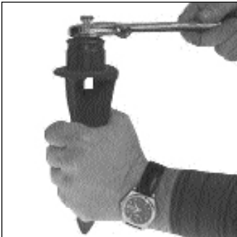
1. Tighten coupling onto mounting device*.