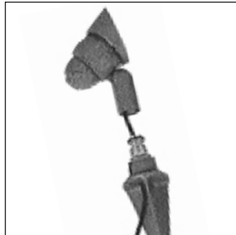
2. Install fixture onto coupling. Note: Kim "KLV" Mounting Options can be installed before fixture is installed.