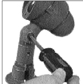
3. Loosen screw, adjust fixture angle, and tighten screw.