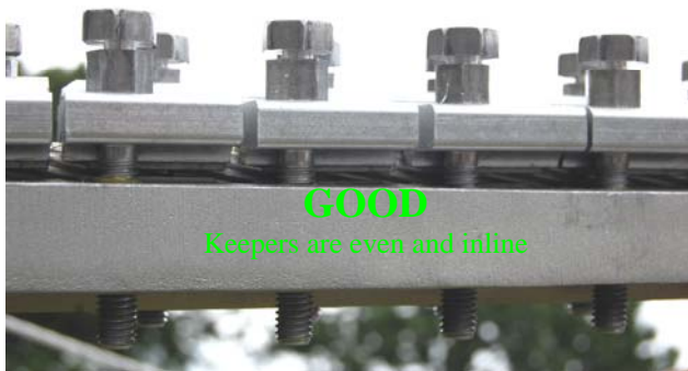
PROPER BOLT TIGHTENING RESULTS