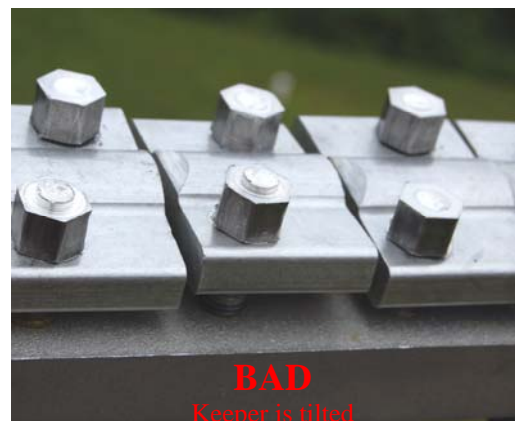
IMPROPER BOLT TIGHTENING RESULTS