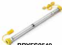
BRYFS2549 Straps not Shown