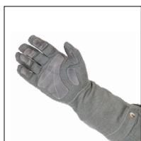
Conductive Gloves w/ Grip Patches