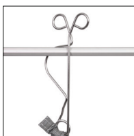
Quick Draw Bonding Clamp (strap not included)