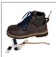
Conductive Boots, Half-Height w/ Braided Copper Leads & Calf Straps