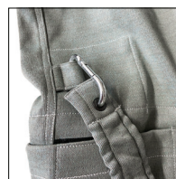
Conductive Bonding Straps (Pair)