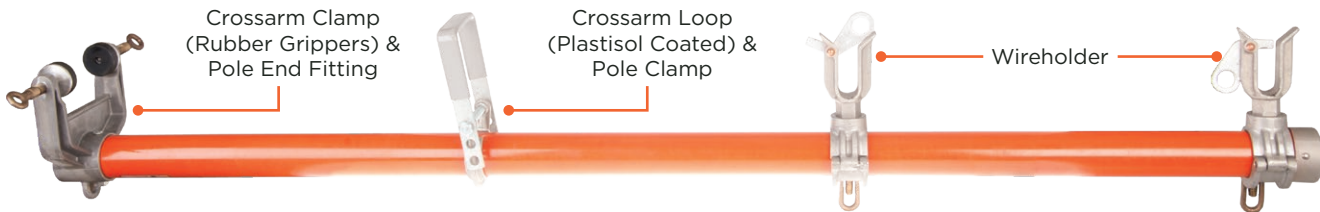
6-ft. Universal Extension Arm PSC4004101

GLOSSY, CLEAN AND DRY EPOXIGLAS® 15kV Phase to Phase 34kV Phase to Phase with M48057 Insulators are used on each wireholder