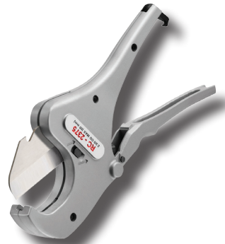
Ratcheting Style Pipe Cutters 2" IPS and smaller pipe Catalog # 33-7433-00 NET PRICE $234.39