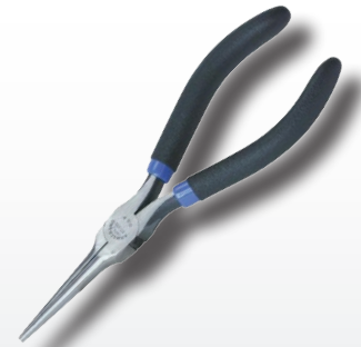
Needle Nose Pliers Used to remove PE chips from ID Seal® Chamfer Tools Catalog # 33-7437-00 NET PRICE $21.06