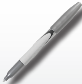
Metallic Permanent Marker Silver Fine Point For marking stab depth. Silver color shows on both yellow and black PE pipe. Catalog # 33-7430-00 NET PRICE $2.33