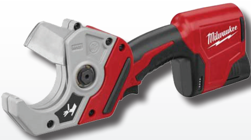
Cordless Shear Style Pipe Cutters 2" IPS and smaller pipe Comes complete with charger and carrying case Catalog #33-7434-00 NET PRICE $289.89