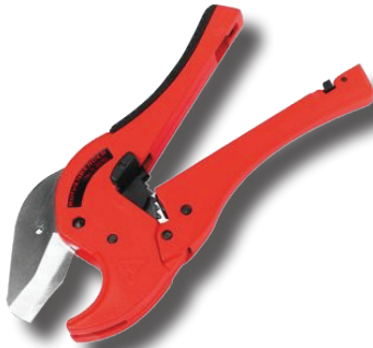
Ratcheting Style Pipe Cutters 1 1/4" OD and smaller pipe Catalog # 33-7432-00 NET PRICE $130.86