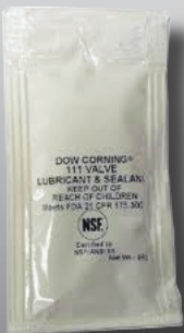
Dow Corning 111 Valve Lube Used to lubricate PE Pipe before insertion into ID Seal® Con-Stab Fittings Catalog # 34-7287-00 NET PRICE $0.99