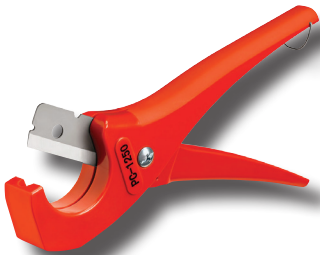
Scissor Style Pipe Cutters 1 1/4" OD and smaller pipe Catalog # 33-7431-00 NET PRICE $26.20