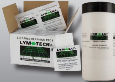
Cleaning Wipes Used to clean PE pipe before making connection per installation instructions Catalog #33-7429-00 ~ Cannister, 100 wipes Catalog #33-7429-01 ~ Box, 60 individual packets NET PRICE $31.96 (Cannister, 100 wipes) NET PRICE $20.36 (Box, 60 individual packets)