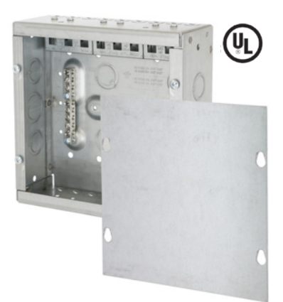
Surface Mount Cover & Ground Bar Included