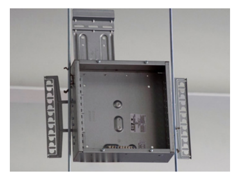
Grand Slam Box installed using Multi-Function Clips on threaded rod