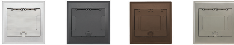
Aluminum Powder Coat Black Powder Coat Bronze Powder Coat Brass Powder Coat