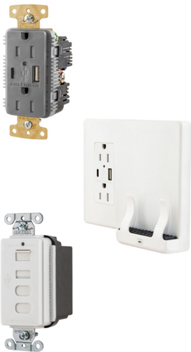
Power Delivery USB Receptacle Type C

Our 4-port charger outlets feature a USB port door, which shuts off power when closed. This eliminates all current flow for a no-load draw. Ideal for energy-efficient design.