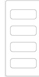
1-4 Button w/ No Light Pipe