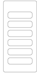
6 Button w/ No Light Pipe