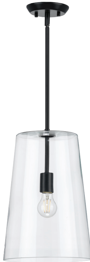
P500242-031 10-1/2" dia., 15-7/8" ht.