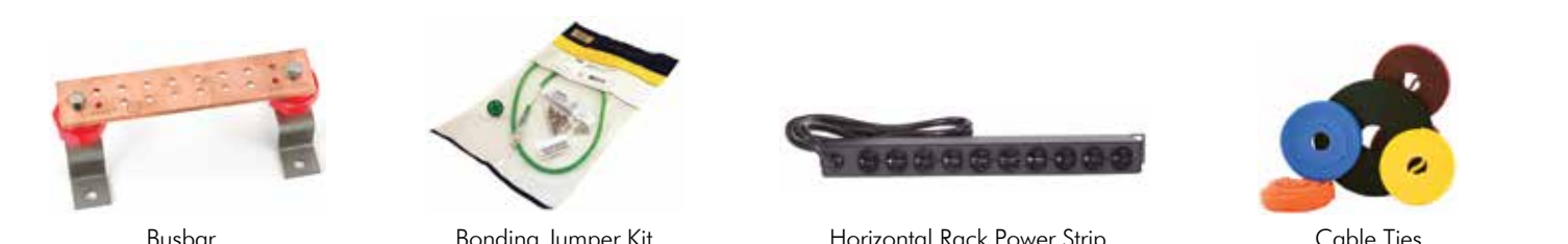
Busbar | Bonding Jumper Kit | Horizontal Rack Power Strip | Cable Ties