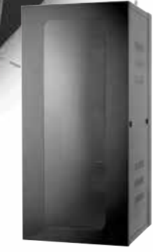
QUADCAB® Wall Mount Cabinet