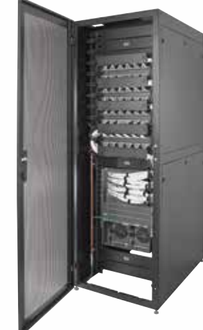
Full Size Enclosure