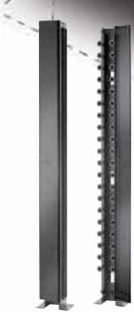
iFRAME Cable Management