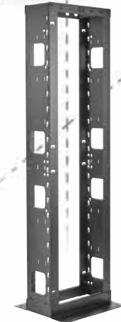
HHR Deep Relay Rack