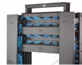
S Series Cable Manager