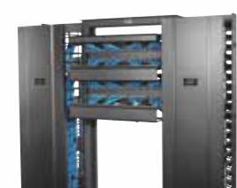
M Series Cable Manager