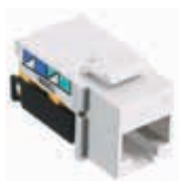
Snap Fit Jack NSJ6W

xx = Color: BK (Black), B (Blue), GY (Gray), GN (Green), I (Ivory), LA (Light Almond), OR (Orange), R (Red), W (White) and Y (Yellow) *Available in BK, B, LA, OR and W only.