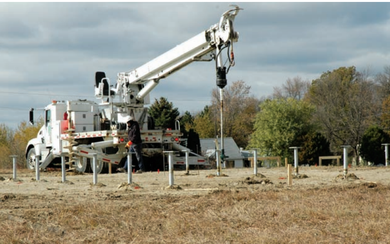
Utilizing owned equipment