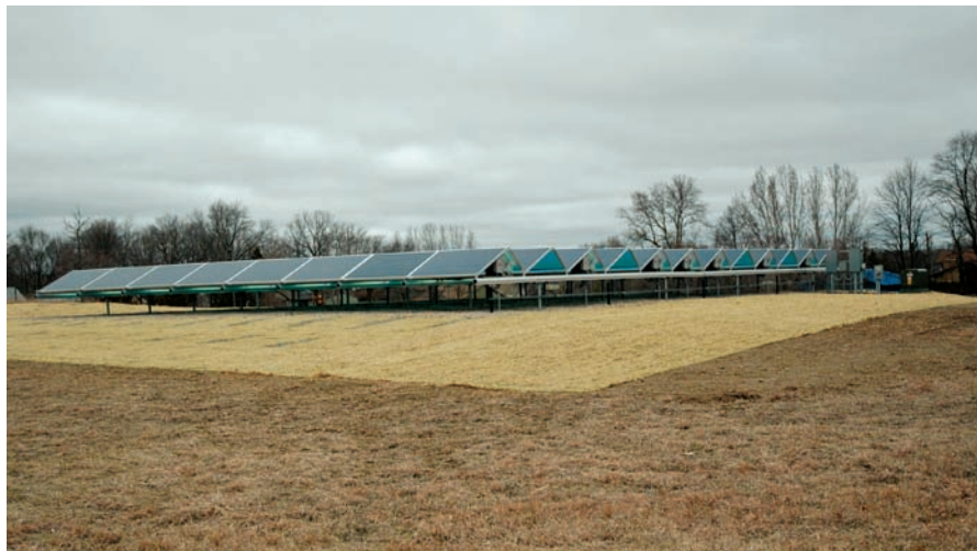
Ready to generate

All pictures taken at Lake Region Electric Co-op during the first install. The entire installation was done by co-op employees.