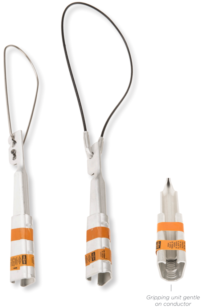
Gripping unit gentle on conductor

*For low tension applications only. Not rated as a full tension device.