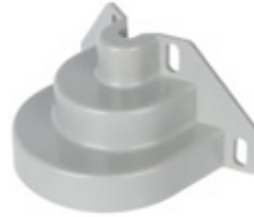
Small boot adapter PSC2030557