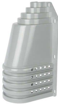
Large boot adapter PSC2030558