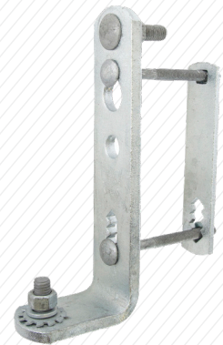
Cutout-Arrester Combination Bracket