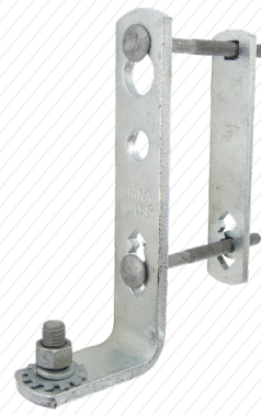
NEMA A Bracket