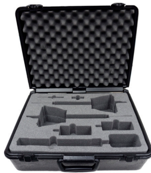
Hard Case (sold separately)