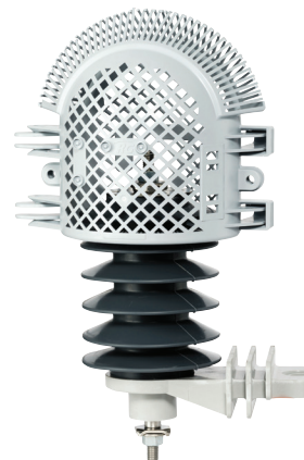
PVR Optima Arrester with BC-15008 Wildlife Guard