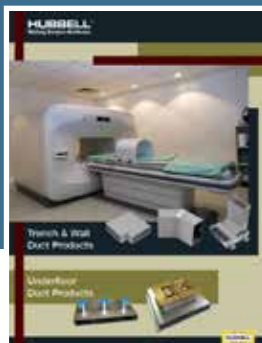
Trench, Wall and Underfloor Duct Products