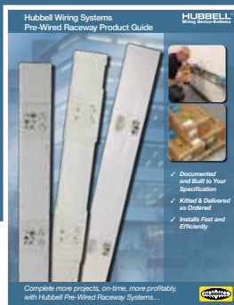
Pre-Wired Raceway Product Guide