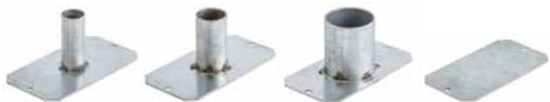
1 gang center feed bottom plates

**Not approved for use in the City of Chicago.