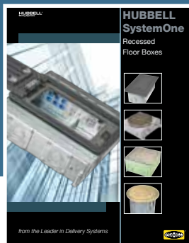
Hubbell SystemOne Recessed Floor Boxes