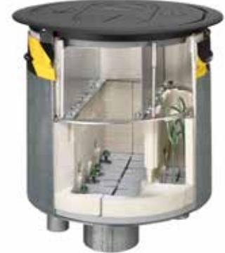
Step 3 Main cover and secondary cover are installed.