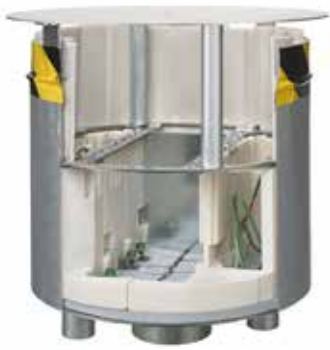
Step 1 10" FRPT is installed. Installation cover and spacer are removed.

The Hubbell SystemOne 10" Fire-Rated Poke-Through (FRPT) furniture feed covers and fittings provide the largest service capacity. The dividing system isolates line voltage and AV during installation.