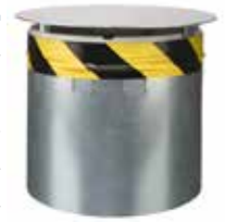
10" fitting with installation cover