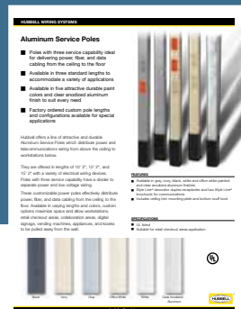
Aluminum Service Poles