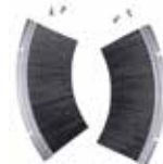
Egress door brushes