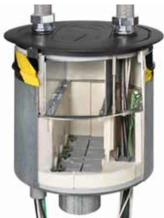
Step 4 Line voltage installed into outer perimeter chambers. Two \frac{3}{4} " or 1" liquid-tight fittings and conduit can be used.