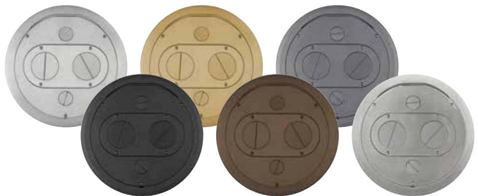
Hubbell SystemOne 10" furniture feed covers are available in all six architectural finishes to complement any decor.