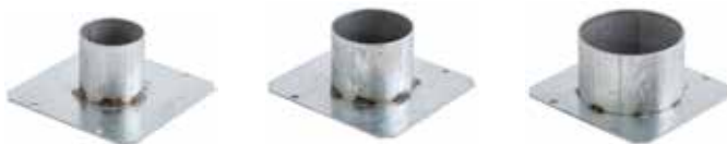
2 gang center feed bottom plates