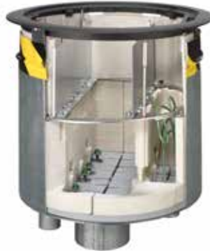
Step 2 Low voltage dividers and flange are installed on to FRPT.