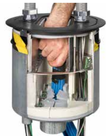
Step 6 Large cover opening allows for easy AV installation. Up to two 2 \frac{1}{2} " bottom feed plates can be installed.