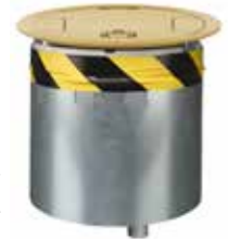
10" fitting with brass cover