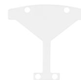
Perimeter device bracket