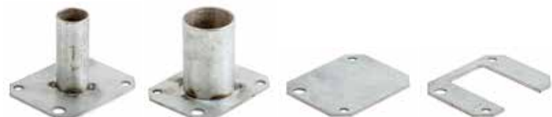
Perimeter feed bottom plates

Extron® is a registered trademark of Extron Electronics. Crestron® is a registered trademark of Crestron Electronics, Inc. FSR® is a registered trademark of FSR Inc.