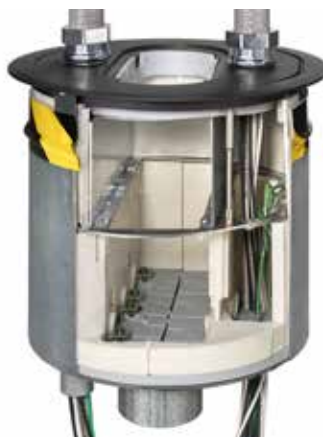
Step 5 Secondary low voltage cover is removed. Low voltage dividers limit access to center chamber.