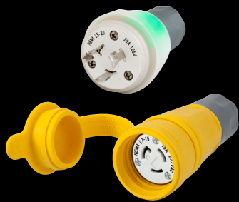
TWIST-LOCK® WIRING DEVICES