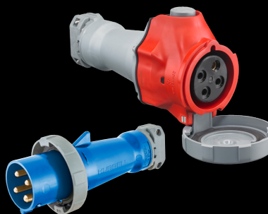
PIN & SLEEVE DEVICES