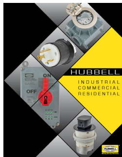
Full Line Catalog

Hubbell offers an extensive literature library for product support. Downloadable PDFs are available online.