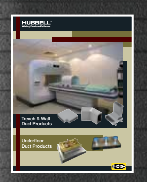
Trench & Wall Duct Products Brochure