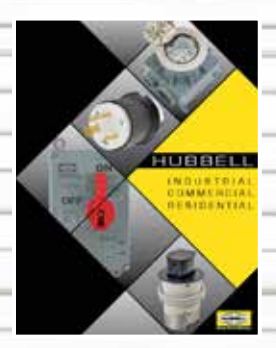
Hubbell Wiring Device-Kellems Full Line Catalog

Hubbell offers an extensive literature library for product support. Downloadable PDFs are available online.