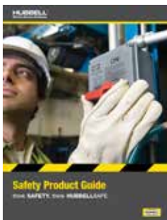
Safety Product Guide