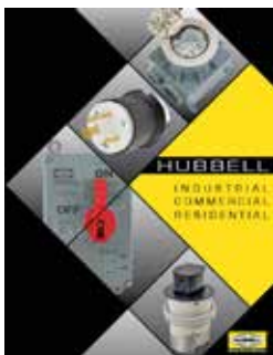
Hubbell Wiring Device-Kellems Full Line Catalog

Hubbell offers an extensive literature library for product support. Downloadable PDFs are available online.