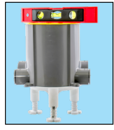
Adjust leveling legs to level top of box.