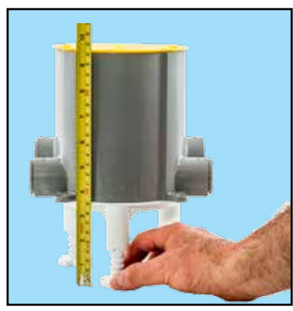
Install floor box on to PFBSTAND. After PVC glue is set, adjust leveling legs to set box to desired height.