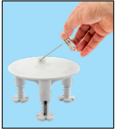
Adjust leveling legs to rough installation height. Apply standard PVC glue per manufacturer's instructions.