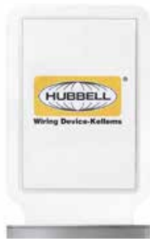
HCPWRPED52LKGRYxxx - Example - Custom Light Kit Graphics