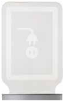
HCPWRPED52LKGRY Standard Light Kit