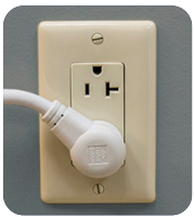
45° Angle Plug (6 outlet 15A models only)

Green LED indicates surge protection working