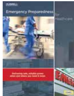
Emergency Preparedness for Healthcare