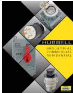
Full Line Catalog

Hubbell offers an extensive literature library for product support. Downloadable PDFs are available online.