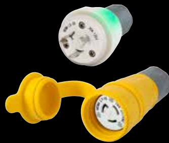
TWIST-LOCK ® WIRING DEVICES