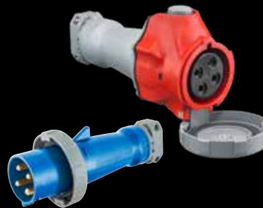
PIN & SLEEVE DEVICES