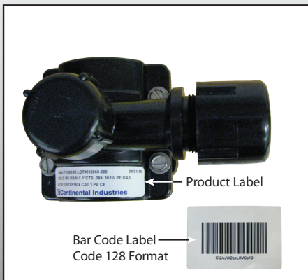
Products are shipped with Bar Code Label placed loose in Shipping Bag