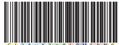
ASTM F2897 Code 128 Bar Code Example Generated by GasOps IQ

We are supplying the bar code printed on a label. The label is placed in the poly bag with the instructions and product. The installer can apply the label to the pipe, the product, or the paperwork when the product is installed.