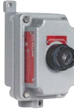
LED Pilot Light

Class I, Div. 1 & 2, Groups B*, C, D Class I, Zone 1 & 2, Groups IIB, IIA Class II, Div. 1 & 2, Groups E, F, G Class III NEMA 3, 7 (C,D) 9 (E,F,G)