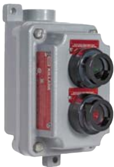
Double LED Pilot Light