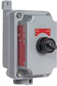
Two Position Selector Switch