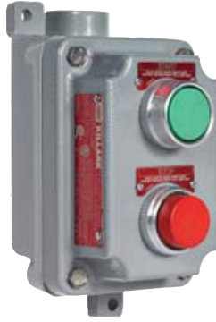
Double Push Button