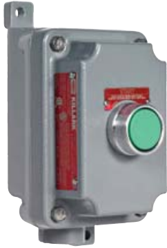
Single Push Button