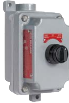
Three Position Selector Switch

Class I, Div. 1 & 2, Groups B*, C, D Class I, Zone 1 & 2, Groups IIB, IIA Class II, Div. 1 & 2, Groups E, F, G Class III NEMA 3, 7 (C,D) 9 (E,F,G)