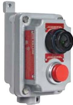
Push Button LED Pilot Light