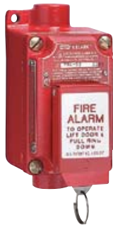
XAL Pull Ring