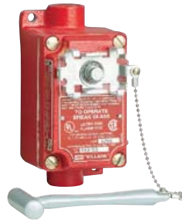
XAS Break Glass

Class I, Div. 1 & 2, Groups C, D Class I, Zones 1 & 2, Groups IIB, IIA Class II, Div. 1 & 2, Groups E, F, G Class III NEMA 7 (C, D) 9 (E, F, G)