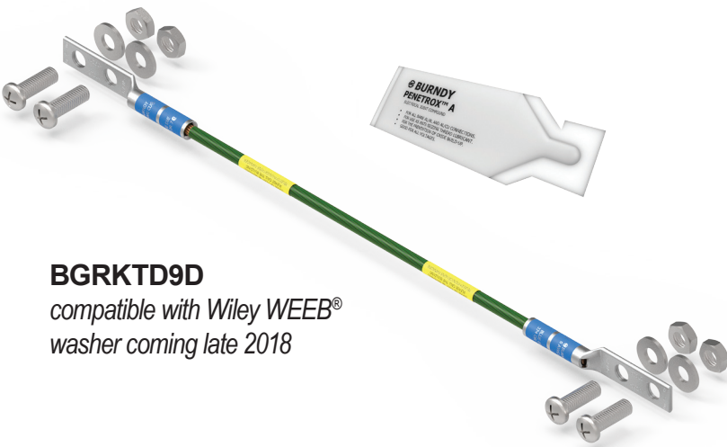
BGRKTD9D compatible with Wiley WEEB® washer coming late 2018

Our new Grounding Kits bundle the same quality UL Listed connectors you trust with value-adding components such as: conductor, installation hardware, oxide inhibitor, labeling and installation instructions as an example. The kits are available in multiple variations and can be customized for your specific requirements upon request.