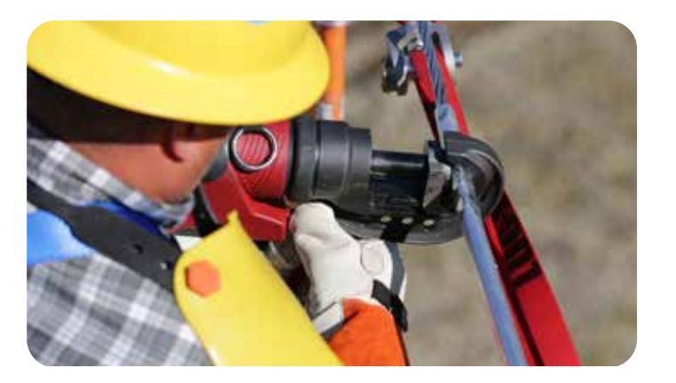
Range Taking Capability: #4 AWG to 1000 kcmil