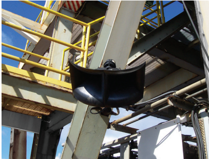
Public Address / General Alarm