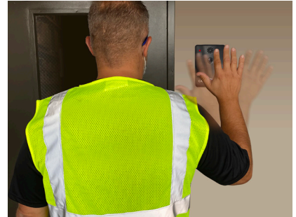
Multi-functional IP Endpoints

The Power of IP-based Control & Communication Modernizing system integrity, functionality, and communications in the most demanding environments.